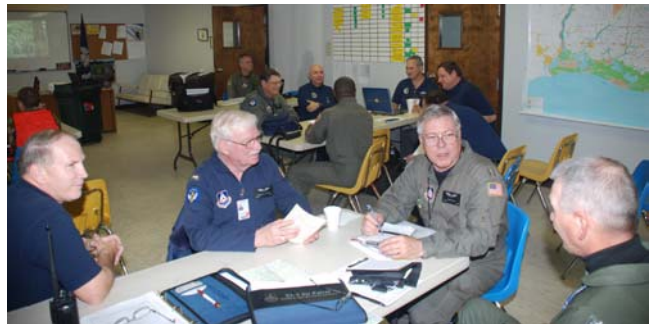
Air Ops. kept busy throughout the rated period.