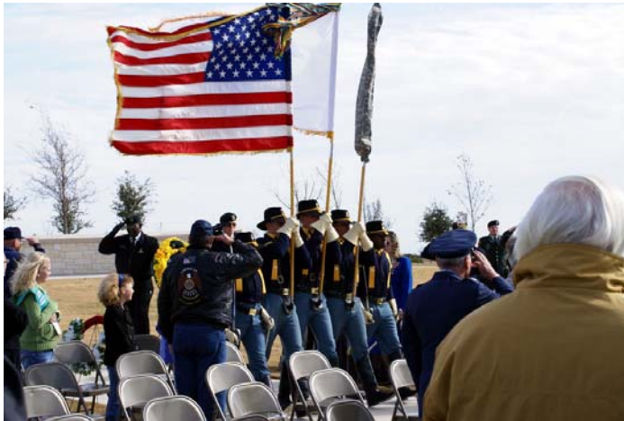
The 1 st Cavalry Division Honor Guard posts the colors.

KILLEEN, Texas – At the Central Texas State Veterans Cemetery, Saturday 13 December dawned a chilly and windy day, though not as cold as in other parts of the country. On this day, at 12 noon Eastern Standard Time, active duty members of the armed forces would lay wreaths on central monuments located at National and Veterans cemeteries across the United States. A ceremony that first took place 15 years ago at Arlington National Cemetery, this is now a national event, performed simultaneously with the participation of military representatives, the Civil Air Patrol, and other organizations.