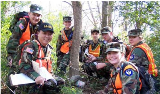
Ground team in the field. All objectives were met.

BATON ROUGE, La. – On the heels of Governor Bobby Jindal having declared the first week of December in Louisiana as Civil Air Patrol Week, the Louisiana Wing completed a grueling assessment graded by the U.S. Air Force, conducted during the weekend of 5-7 December.