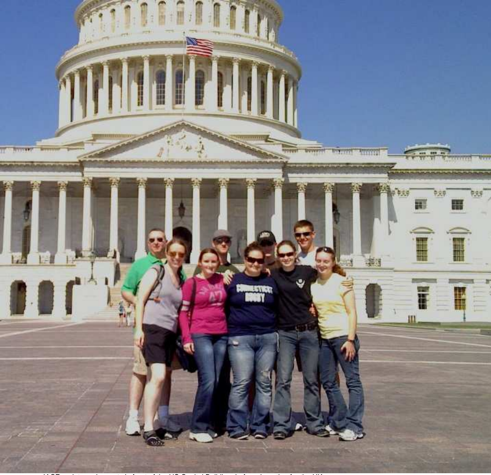
IACE cadets and escorts in front of the US Capitol Building, before departing for the UK.