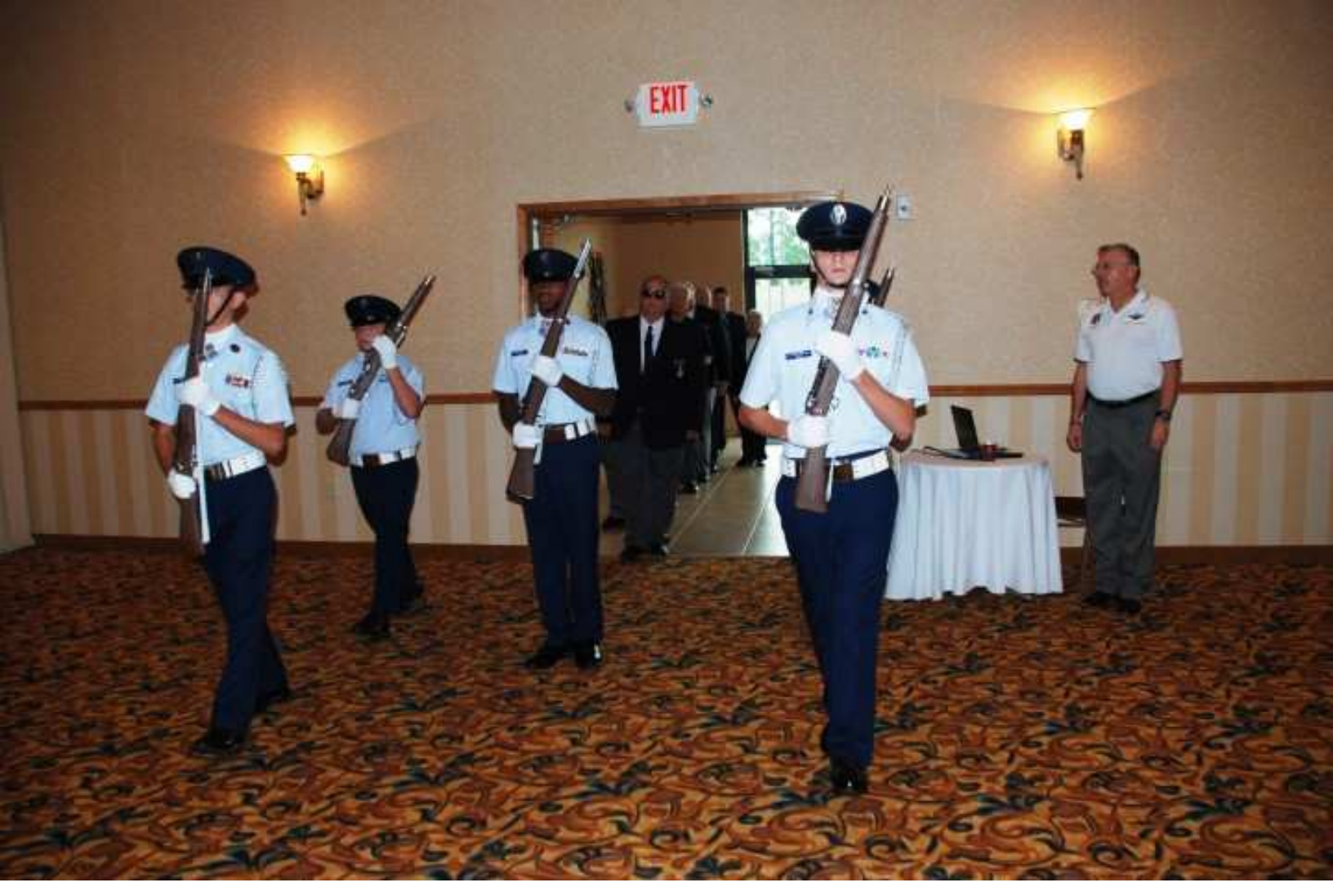
The Louisiana Wing Color Guard forms at the Wing Conference, preparing to render honors as the colors are presented.