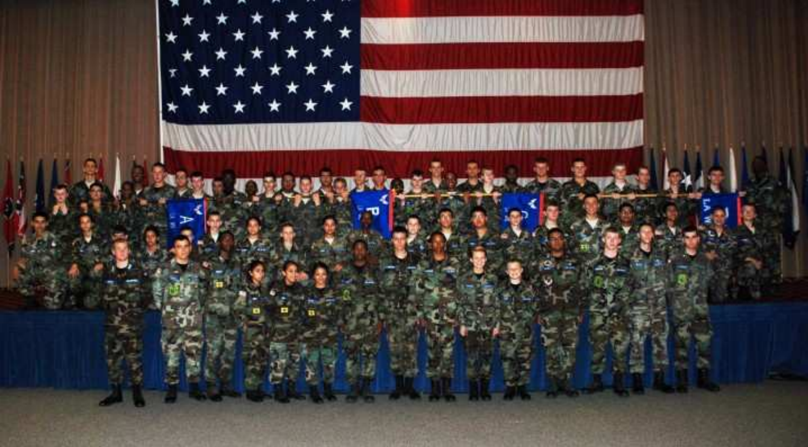
Cadets from Louisiana, Mississippi and Texas Wings form for a group photograph during the 2011 Louisiana Wing Summer Encampment.