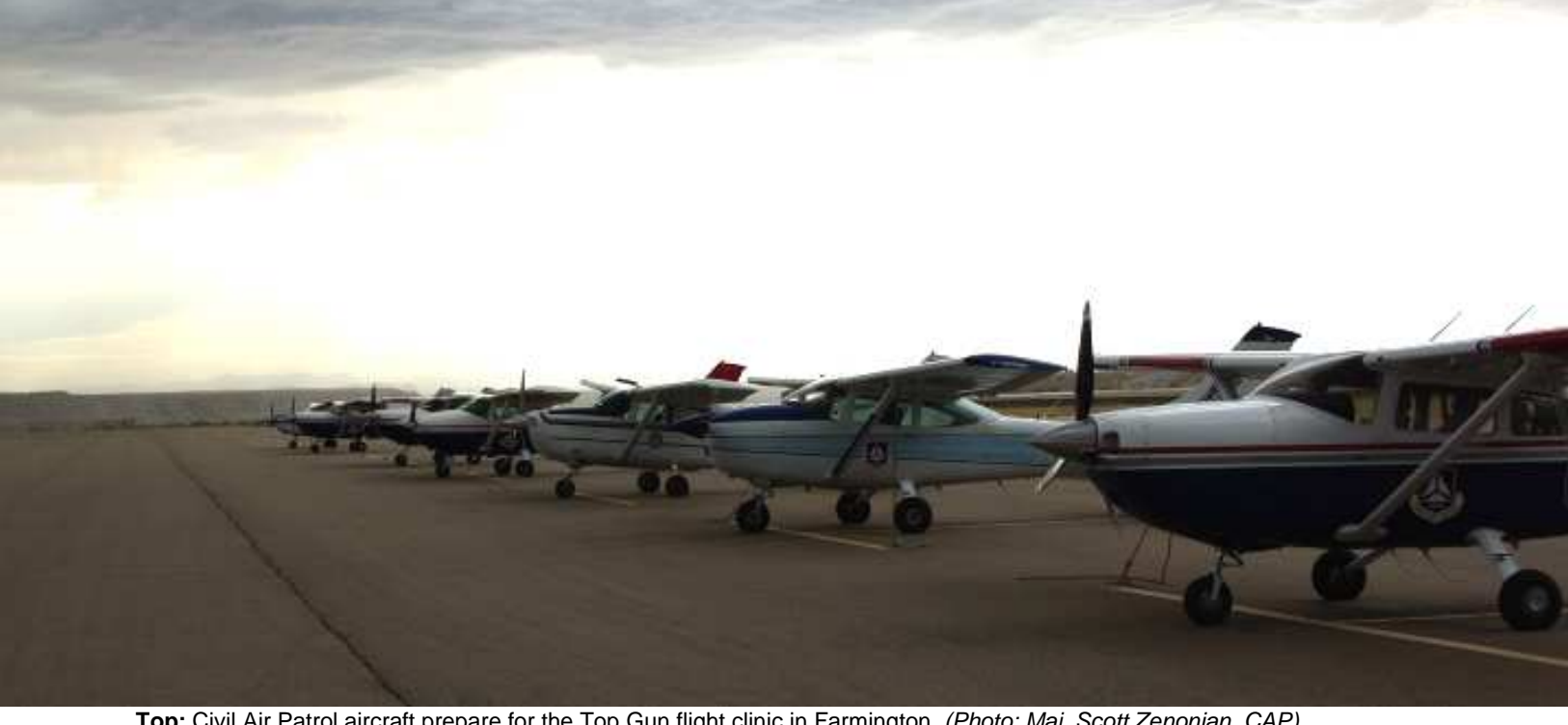
Top: Civil Air Patrol aircraft prepare for the Top Gun flight clinic in Farmington. Bottom: Top Gun Pilots prepare to run "The Gauntlet," a pre-arranged instrument course with stops at local airports.