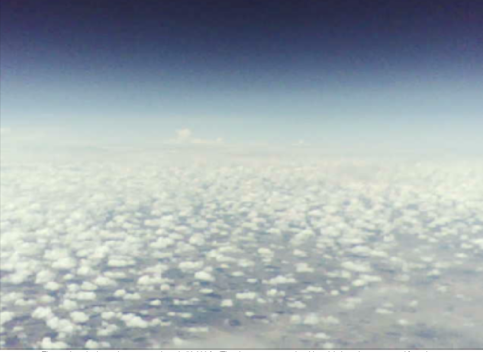
The southern horizon taken at approximately 50,000 ft. (The photos accompanying this article have been extracted from the video that was taken automatically by the balloon's on-board camera.)