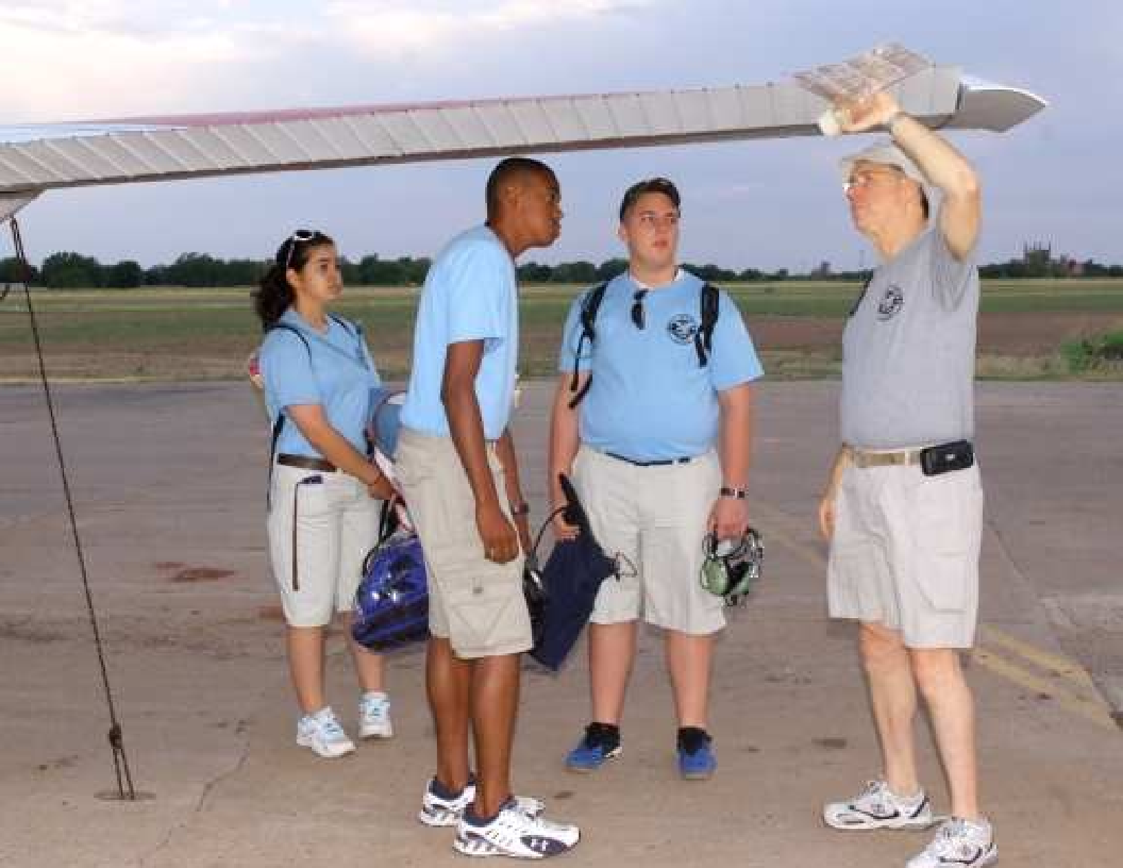
Student pilots pay close attention to pre-flight inspection in the cool of the day. Early morning flights were favorites, as the days reached very high temperatures.