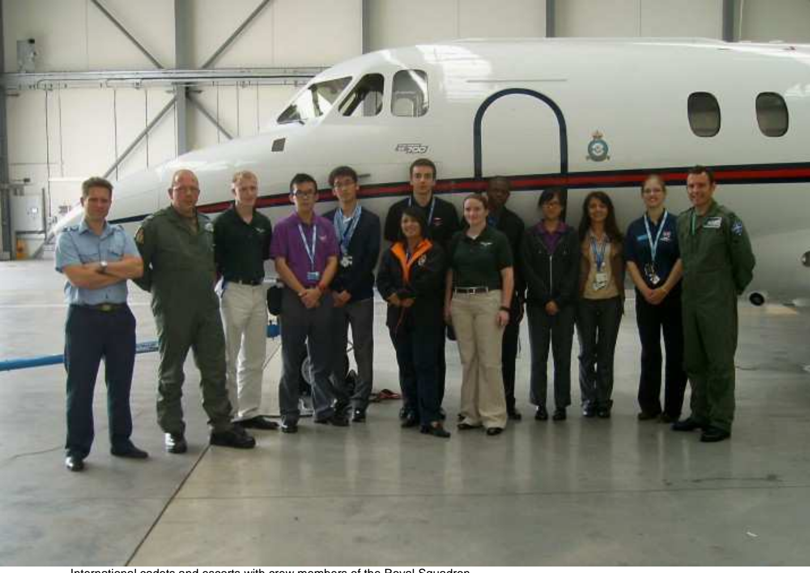
International cadets and escorts with crew members of the Royal Squadron.

IACE is an annual exchange of visits by air-minded youth of the U.S., Canada, Europe, the Middle East, Africa, East Asia and the Pacific Rim with the objective of promoting international