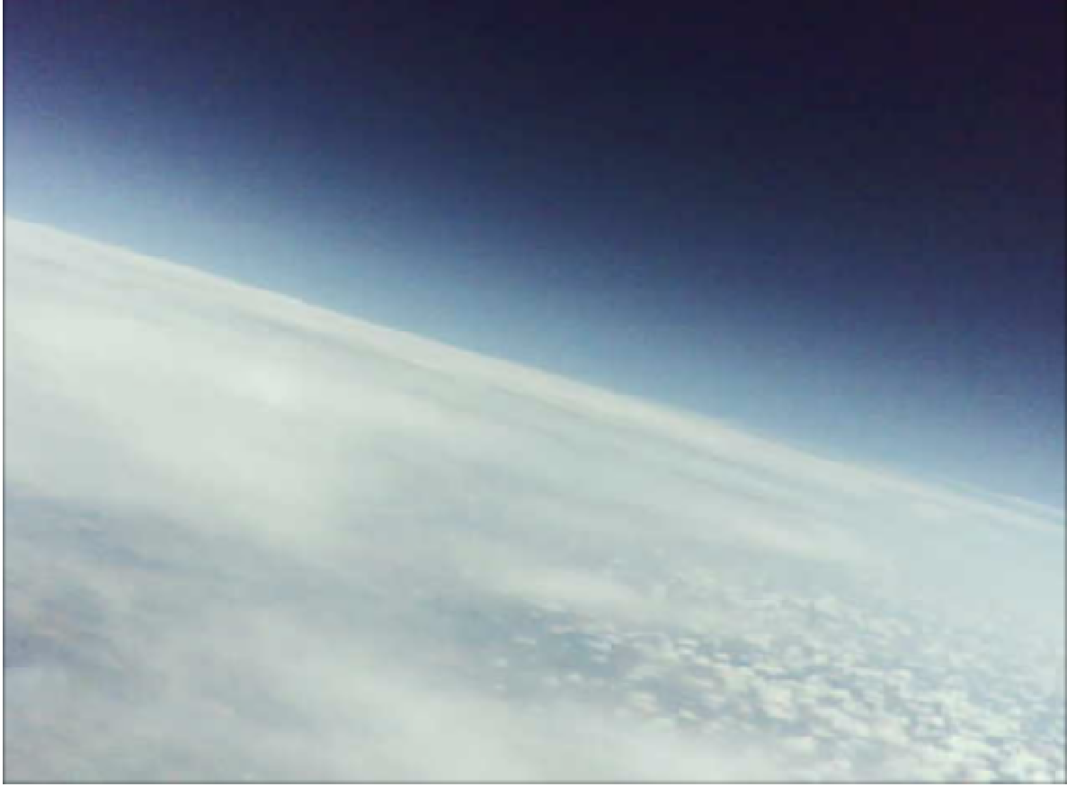
Taken from Explorer II's "package" payload, the southeastern horizon from approximately 60,000 ft.

removed the hose from the balloon and opened the valve on the fill tube to determine if gas could get past the valve. Powder from inside the balloon flowed out into the wind, but no helium seemed to escape. Since it appeared that the powder wasn't blocking the aperture into the balloon, there had to be a blockage in the regulator.