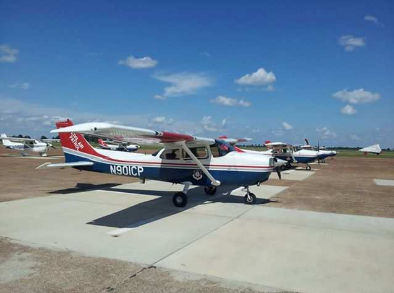
Top: CAP planes on the tarmac, ready to fly.